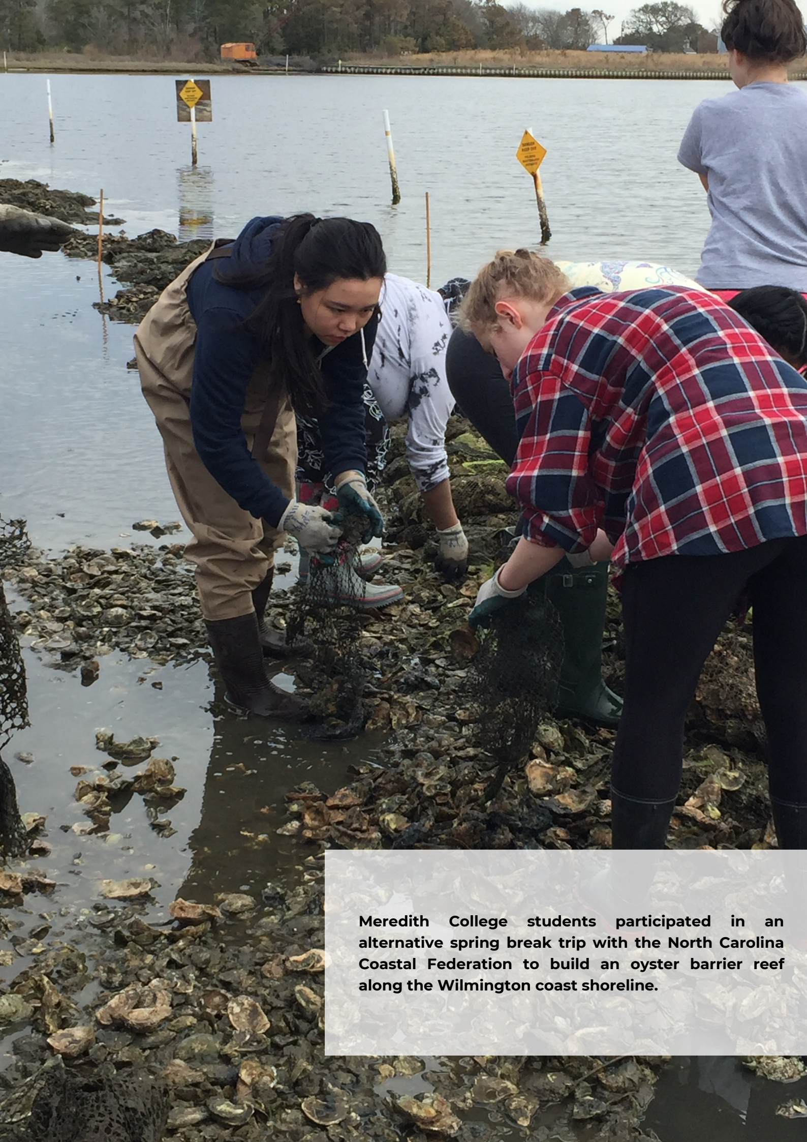
Meredith College students participated in an alternative spring break trip with the North Carolina Coastal Federation to build an oyster barrier reef along the Wilmington coast shoreline.