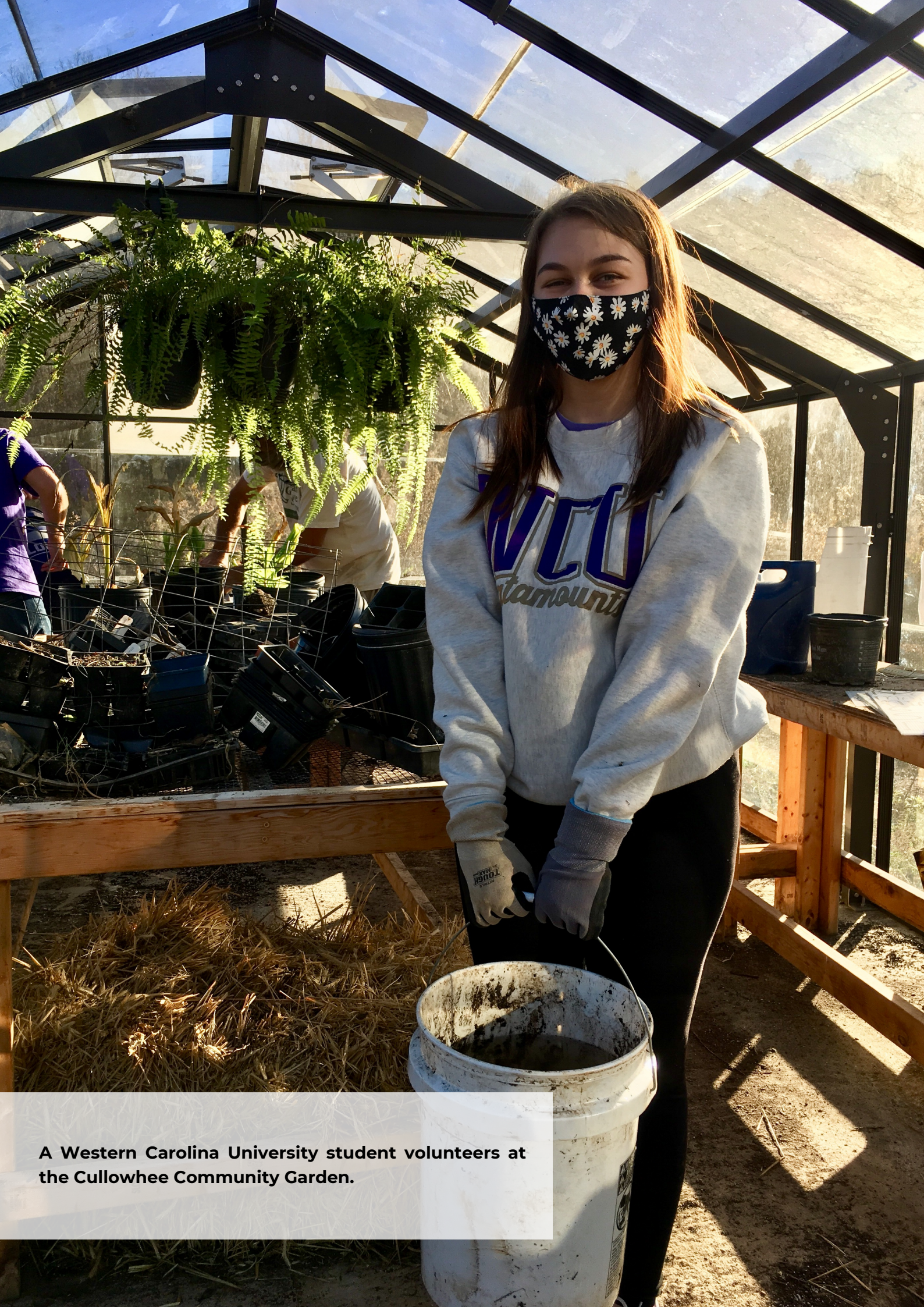
A Western Carolina University student volunteers at the Cullowhee Community Garden.