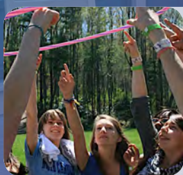
SORORITIES & FRATERNITIES