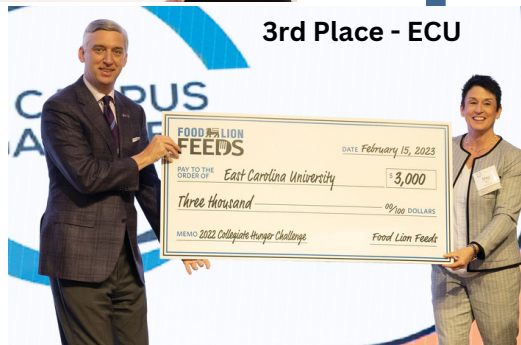
3rd Place - ECU