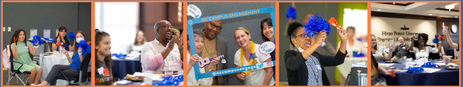
Images above from the June 29 Launch Parties at High Point University and NC State University