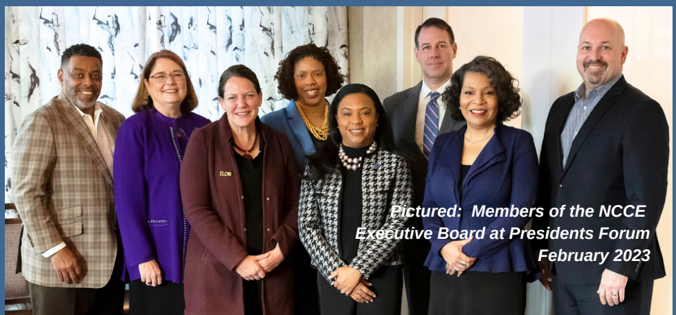
Pictured: Members of the NCCE Executive Board at Presidents Forum February 2023