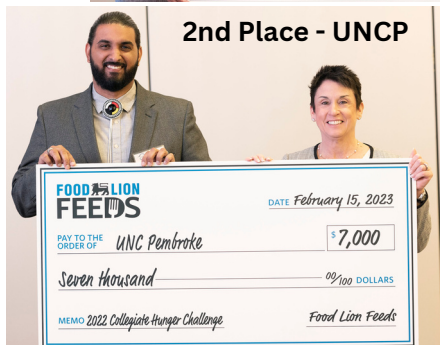
2nd Place - UNCP