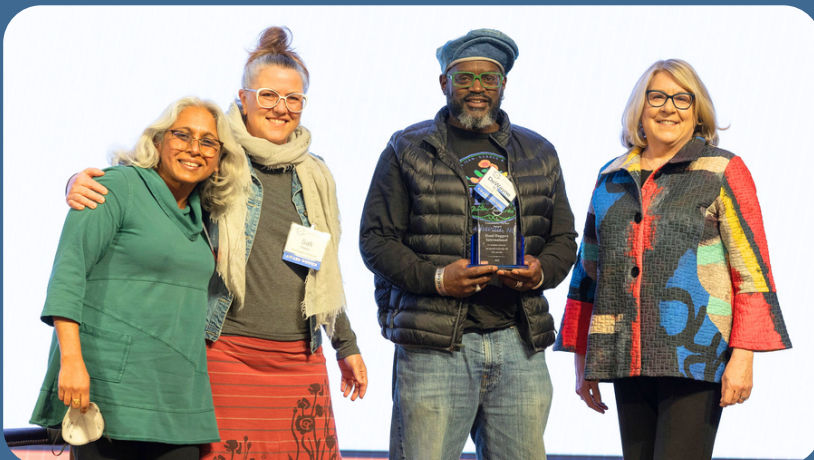
Hood Huggers, International Campus Partner: UNC Asheville