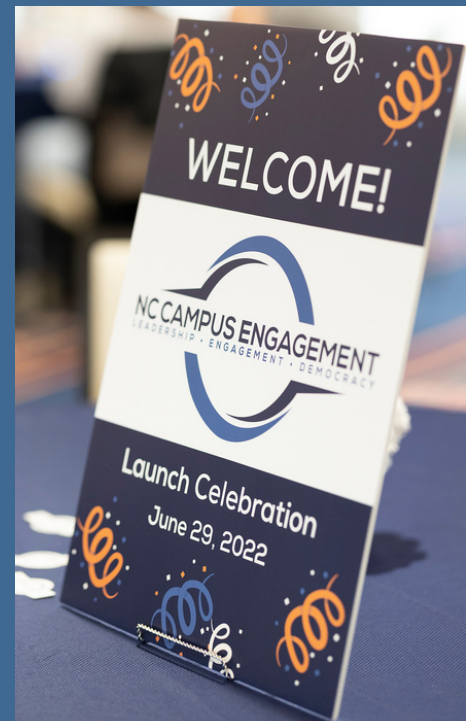
Pictured: The NC Campus Engagement Launch Party at High Point University June 29, 2022